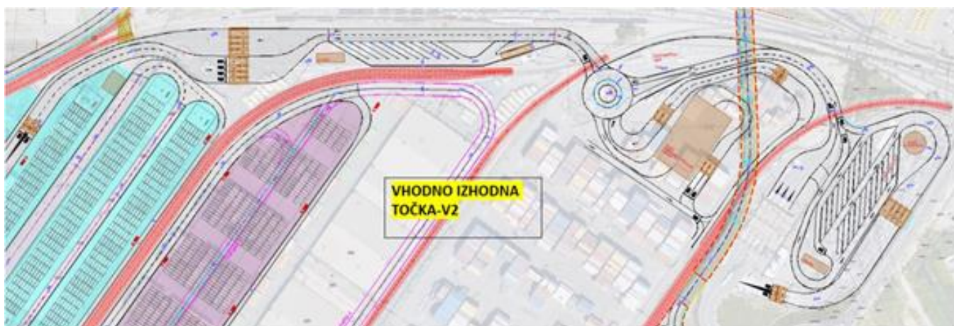
Picture: Informative sketch entry-exit point (The picture does not fully comply with the requirements of the contract specification, it is only an idea - an informative sketch).

The subject of the contract is the installation of a test OCR portal at the existing entry point of the Port of Koper and the installation of a new entry-exit point for trucks with a truck and container recognition system (OCR) in two phases (first phase: Installation of a test OCR portal and second phase: Installation of other entry-exit point equipment). The contract also includes ten (10) years of maintenance of the installed equipment.